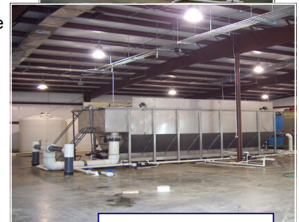
ETS RT-180 DAF treating AMD

hydroxide, followed by flocc mix tanks for polymer addition and flocculation. The system kept the site's owners in compliance with state regulations for their discharge.