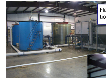
Flash mix and flocculation tanks prior to DAF

ETS provided an RT-180 DAF system (180 ft 2 of surface area) to provide treatment of an AMD stream in central Pennsylvania prior to discharge to a local stream. The unit was preceded by flash mix tanks for automatic pH control using sodium