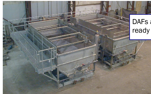
DAFs and catwalk ready for shipping

The DAFs feature a single integral catwalk to provide easy access to both DAF systems.